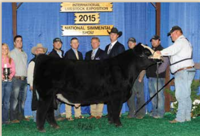
CAJS BLAZE OF GLORY - AI service sire

Here is a soft made, deep middled, easy keeping heifer. She is out of the calving ease CCA Emblazon bull. Her granddam is a Hollywood Queen daughter that always produces a good one.