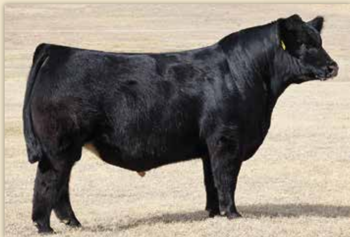
W/C EXECUTIVE 187D - AI service sire (full brother to W/C Executive Order 8543B)